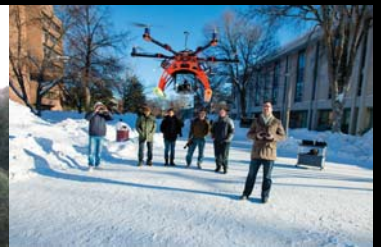
UNMANNED AERIAL VEHICLES & REMOTE SENSING